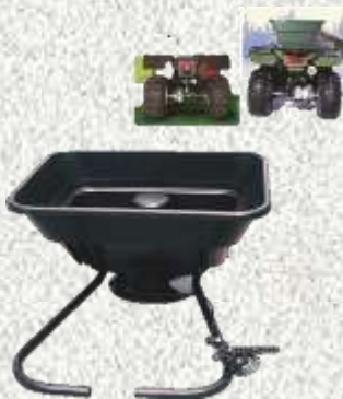
12V 80LB Spreader MODEL NO. TL31506

Our ATV Broadcast Spreaders and Discs are perfect for deep woods, wildlife food plots, small gardens, row cultivation, or yard prep work.