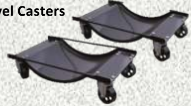
Model No: TL13201 3.5" Swivel Casters