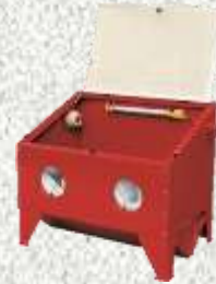
Tabletop Sandblast Cabinet Model No: TL32201