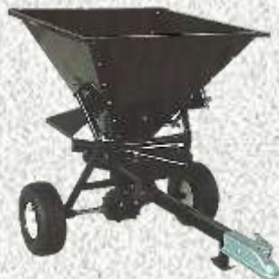
350LB Spreader MODEL NO. TL31501