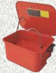
3.5 Gallon Parts Washer Model No: TL34102