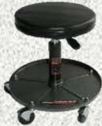
Adjustable Seat Creeper Model No: TL07401