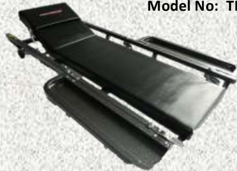
Mechanics Creeper Model No: TL6206