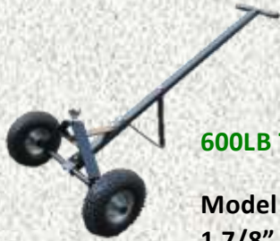
600LB Trailer Dolly Model No: TL22301 1 7/8" Hitch Ball; 10" Pneumatic Tires