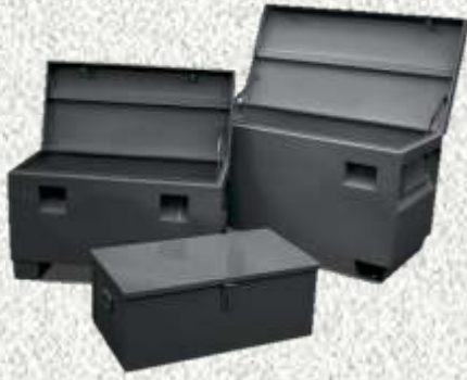
3 Piece Steel Job Box Set Model No: TL19107