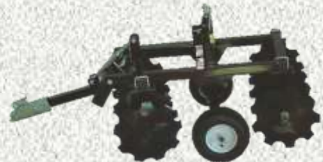
Tow-Behind ATV Disc MODEL NO. TL31405